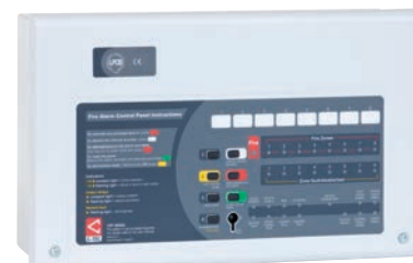
CFP702-2 / CFP704-2 / CFP708-2